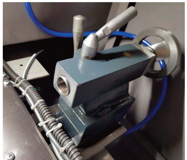
AJAT 210 TAIL STOCK